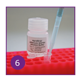
Add 1000 µL assay dilution buffer in a dilution tube.*

2 lines are visible. The intensity of the line in the test zone is indirectly proportional to the mycotoxin concentration and has to be measured with the AgraVision™.